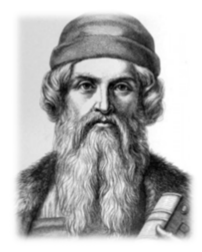
Here it is with (respectively) \img[src=documentation/gutenberg.png,width=120px], \img[src=documentation/gutenberg.png,height=200px], and \img[src=documentation/gutenberg.png,width=120px,height=200px]:

Here is a 200x243 pixel image output with \img[src=documentation/gutenberg.png]: